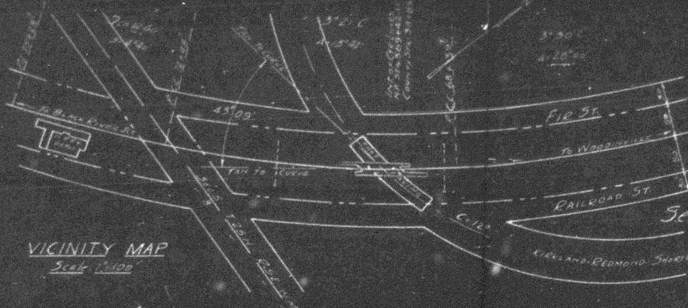
VICINITY MAP Scale 1"=100'

N.P.R.Y. Seattle Divn-Lake Washington Bell Line Wash. Val. Sec. No 8-A KIRKLAND INSTALL UNDERCROSSING AFE 1643-26 Scales Noted Seattle Wash